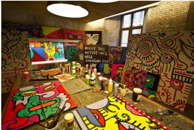
LAST CALL TO SHANGHAI